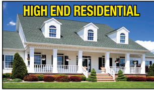
HIGH END RESIDENTIAL